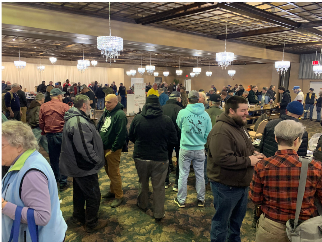
By 10:30 AM on Saturday it was a packed house. Total Attendance of 305.