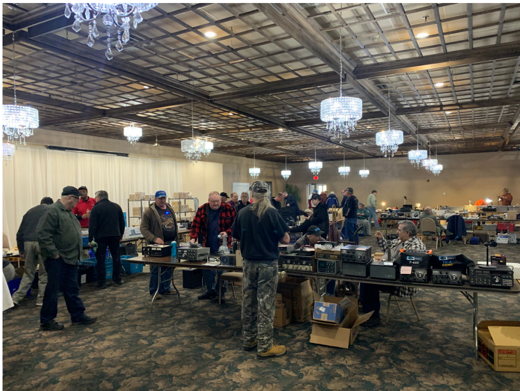
Exhibition Hall at the Maine State Convention & Hamfest. The morning crowd getting an early start on finds.