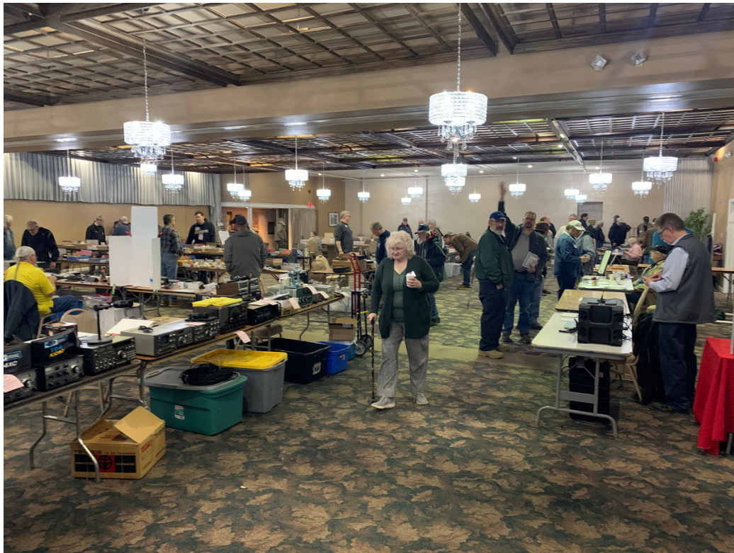
Great selection of amateur radio gear was present at the hamfest