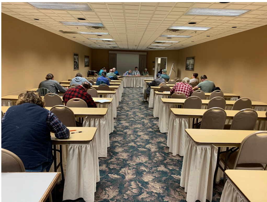
VE Testing at the end of the Hamfest & Convention